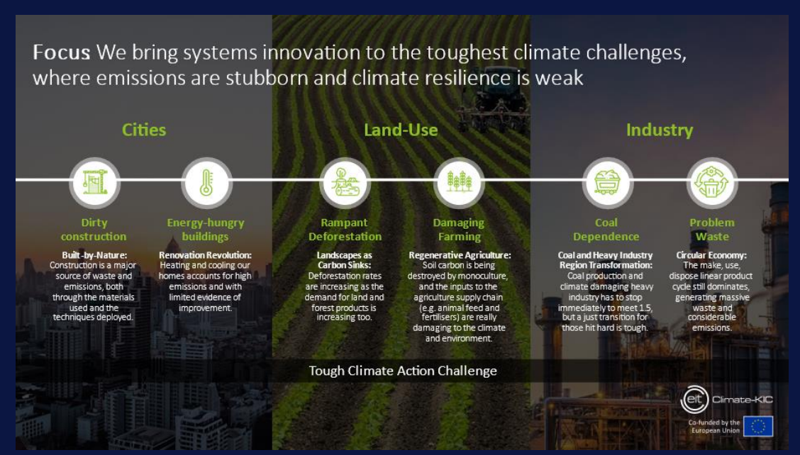
Figure 1: EIT Climate-KIC's focus on bringing systems innovation to some of the most intractable climate action challenges

Our attention is focused on systems where emissions are tough to reduce – cities, land-use, industry – and on some of the most intractable challenges associated with these systems (see fig. 1).